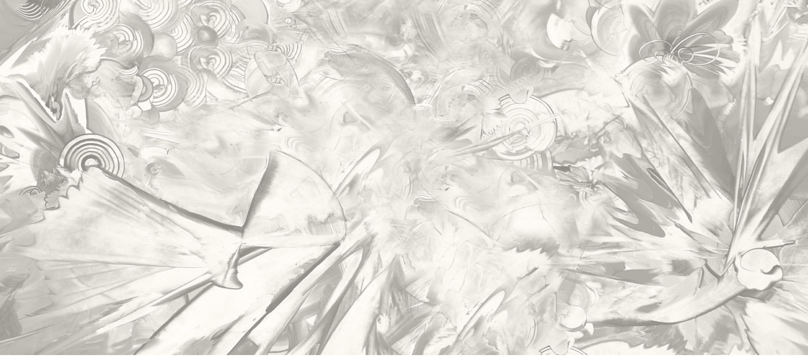
DNA - PART 2